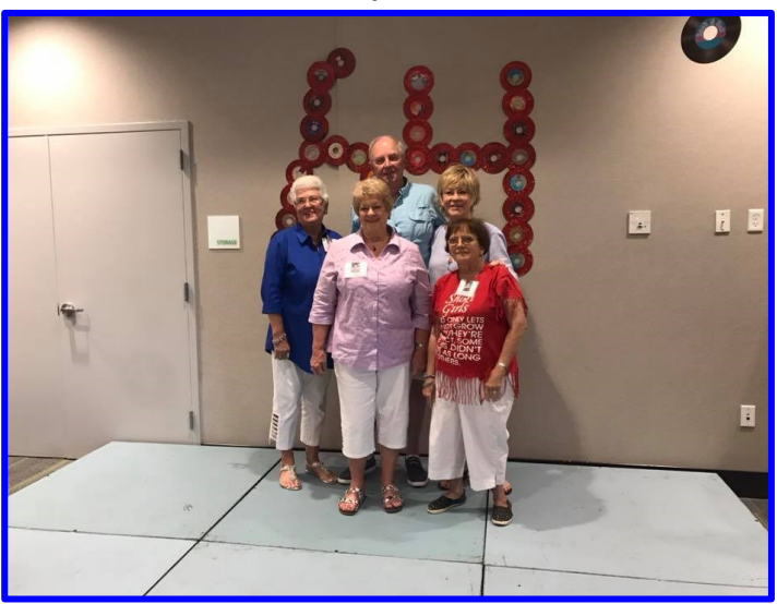
5 of the 7 Committee Members