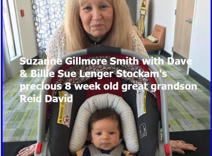
What a Doll