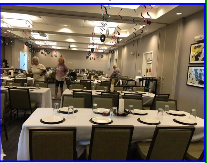
Setting up banquet room