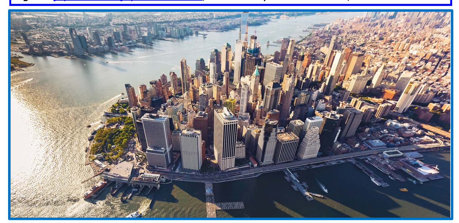
More people live in New York City than in 40 of the 50 states.

Please help us out. Don't forget to include us on any changes in your contact information. If you should move or change telephone, snail mail address or email address please let us know. It's very easy and you may do so by clicking on the following link <a href="mailto:joplinmo64@joplinmo64.com">joplinmo64@joplinmo64.com</a>, and enter your information, then click "Send".