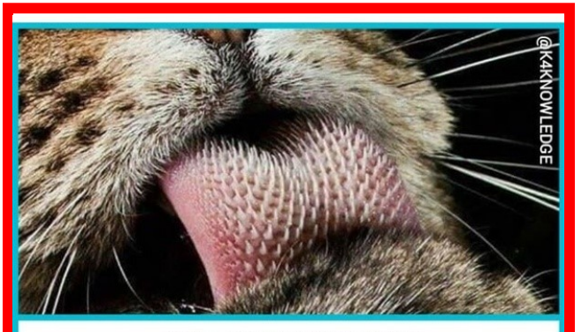
DID YOU KNOW?

A TIGER'S TONGUE IS SO ROUGH, IT CAN LICK THE PAINT OFF BUILDINGS AND STRIP THE SKIN FROM THE BONES OF AN ANIMAL.